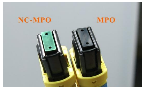
Figure 1. Next to a regular MPO connector, NC-MPO connector has a visible AR coating

NC-MPO fiber connector has an optical fiber end face lower than the plastic ferrule surface, and an anti-reflection coating is on all the fiber end faces (Fig. 1). When NC-MPO connectors are mated, there is a small air gap between all the fiber end faces. Anti-reflection coating can prevent multiple reflection of light, while the lower fiber end face (Fig. 2) ensures that the mating fiber end face is not damaged. The working pressure on the NC-MPO connector is very small, and the fiber end face does not need to protrude, greatly simplifying the polishing process, and reducing test equipment costs.